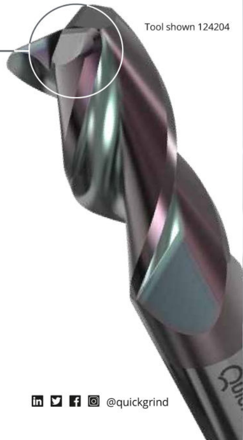
Tool shown 124204

Corner radii for machining aluminium and non-ferrous