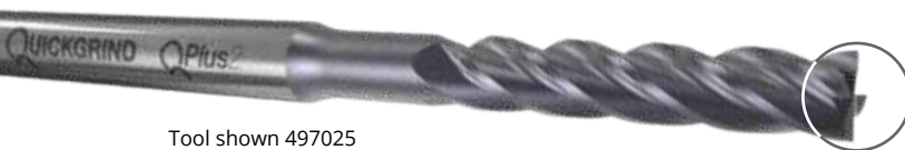
Tool shown 497025